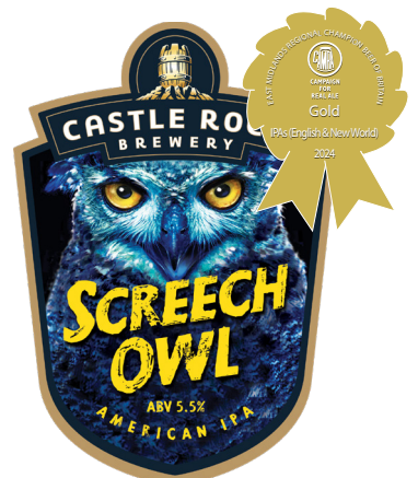
SCREECH OWL 5.5 % ABV

Balanced IPA with a fresh citrus aroma, delicate sweetness and a long hop finish.