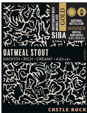
OATMEAL STOUT 4.6 % ABV • VEGAN

Brewed to the traditional East Midlands style, Preservation is a russet-coloured, easy drinking full flavoured best bitter.