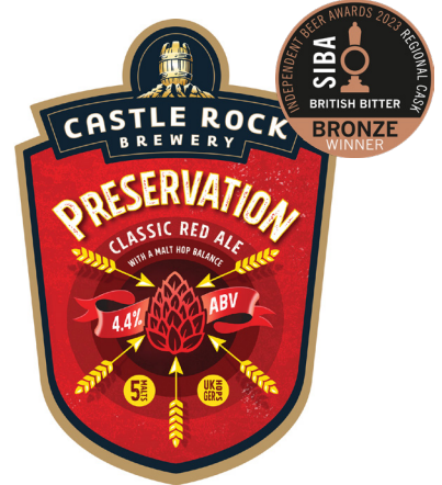
PRESERVATION 4.4 % ABV

Full-bodied mild with a hoppy aroma and well-balanced bittersweet taste. GOLD CAMRA Champion Beer East Mids Region