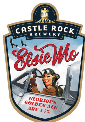
ELSIE MO 4.7 % ABV

Rich, rounded and full with aromas of dried fruit and marmalade, followed by deep coffee, caramel and chocolate flavours.