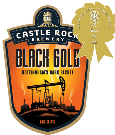
BLACK GOLD 3.8 % ABV

Full-bodied mild with a hoppy aroma and well-balanced bittersweet taste. GOLD CAMRA Champion Beer East Mids Region