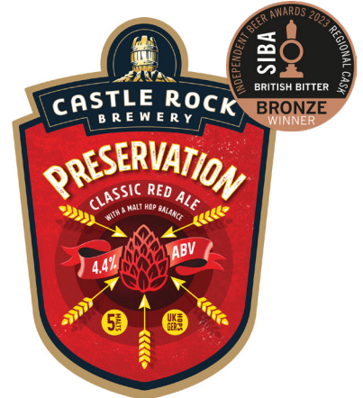
PRESERVATION 4.4 % ABV

Full-bodied mild with a hoppy aroma and well-balanced bittersweet taste. GOLD CAMRA Champion Beer East Mids Region