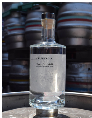
BEER GIN #006 70CL • 44% ABV

A zesty mix of orange peel, grapefruit and lime for a fresh and fragrant gin. A medley of citrus fruits and a touch of fiery sichuan pepper make this gin a wonderful match for a classic tonic.