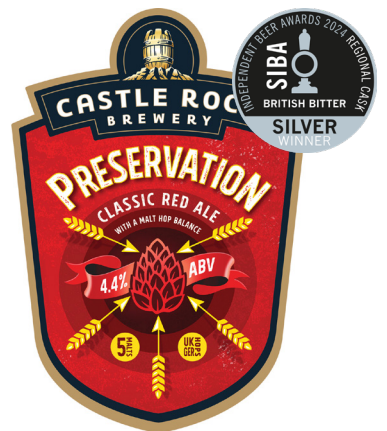
PRESERVATION 4.4 % ABV

Full-bodied mild with a hoppy aroma and well-balanced bittersweet taste. GOLD CAMRA Champion Beer East Mids Region.