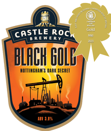
BLACK GOLD 3.8 % ABV

Full-bodied mild with a hoppy aroma and well-balanced bittersweet taste. GOLD CAMRA Champion Beer East Mids Region.