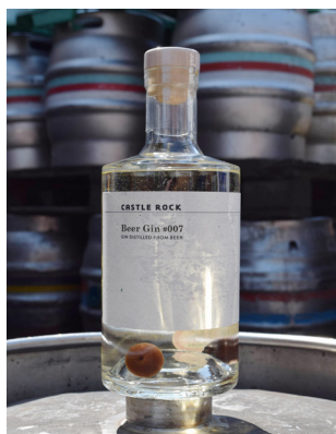
BEER GIN #007 70CL • 42% ABV

During the CV-19 lockdowns, like many others we found ourselves with surplus beer in the cold store. As part of our continuing drive to reduce waste, we decided on a little experiment... We started working with a distillery to turn our surplus beer into gin! Our available gins this week include some classic flavour profiles and others offering something a little different. Enjoy!