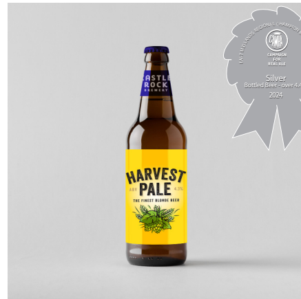
HARVEST PALE 4.3% ABV • 8 x 500ml

Single malt golden ale brewed with Low Colour Maris Otter malt. Delicate citrus and floral notes. ALSO IN: Cask