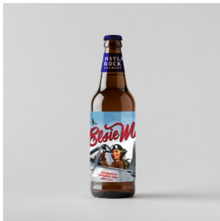
ELSIE MO 5.0% ABV • 8 x 500ml

Balanced IPA with a fresh citrus aroma, delicate sweetness and a long hop finish. ALSO IN: Cask