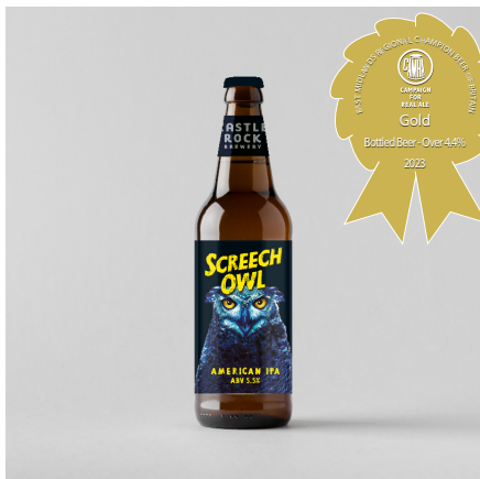
SCREECH OWL 5.5% ABV • 8 x 500ml

Balanced IPA with a fresh citrus aroma, delicate sweetness and a long hop finish. ALSO IN: Cask