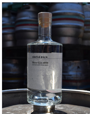
BEER GIN #008 70CL • 40% ABV

We're dreaming of summer with this one. Fruity, summer berries give a wonderful balance to the floral earthy base of juniper, liquorice, angelica and coriander.