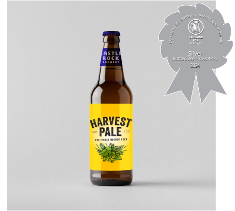
HARVEST PALE 4.3% ABV • 8 x 500ml

Refreshing multi-award-winning blonde beer with delicate citrus character.