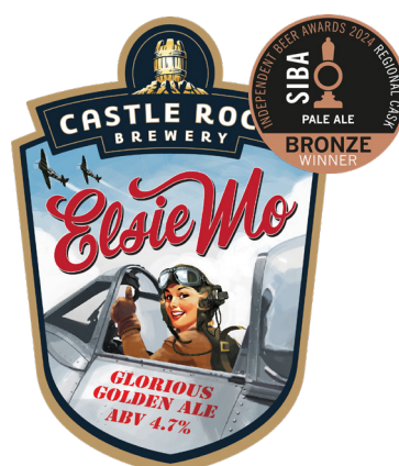
ELSIE MO 4.7 % ABV

A lower-alcohol and sessionable quality alternative. Our House is an easy-drinking extra pale ale with a satisfying crisp finish.