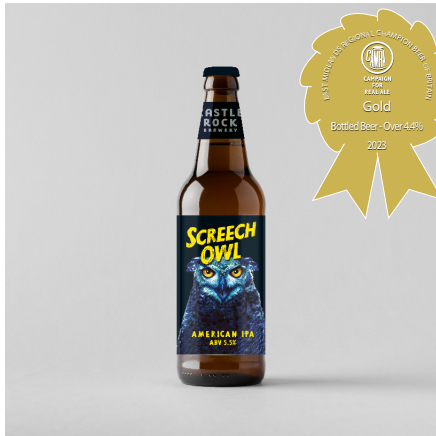
SCREECH OWL 5.5% ABV • 8 x 500ml

Balanced IPA with a fresh citrus aroma, delicate sweetness and a long hop finish.