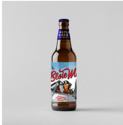
ELSIE MO 5.0% ABV • 8 x 500ml

Single malt golden ale brewed with Low Colour Maris Otter malt. Delicate citrus and floral notes.