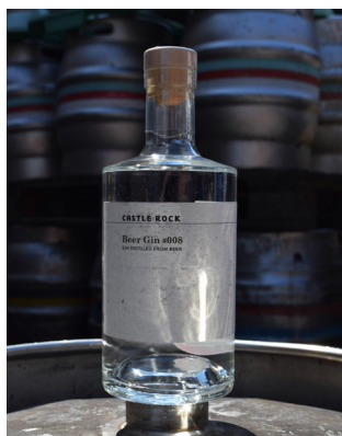
BEER GIN #008

#007: Containing summer berries and notes of liquorice and coriander.