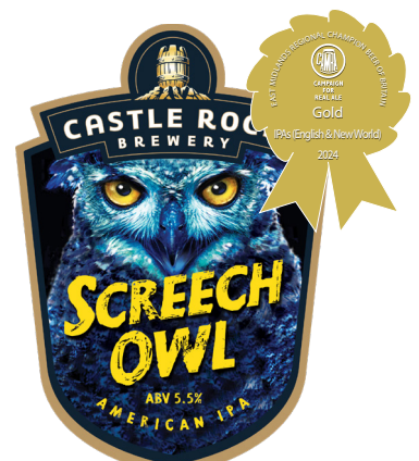
SCREECH OWL 5.5 % ABV

Single malt golden ale brewed with Low Colour Maris Otter malt. Delicate citrus and floral notes. BRONZE SIBA Midlands 2024 Cask Pale Ale Category. ALSO IN: Bottle (8x500ml)