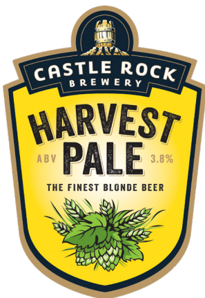
HARVEST PALE 3.8 % ABV

Refreshing multi-award-winning blonde beer with delicate citrus character.