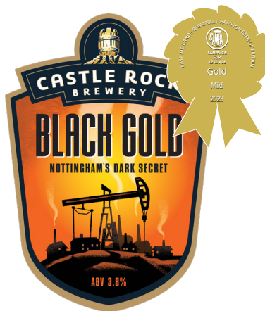
BLACK GOLD 3.8 % ABV

Full-bodied mild with a hoppy aroma and well-balanced bittersweet taste. GOLD CAMRA Champion Beer East Mids Region.