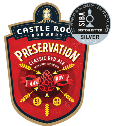
PRESERVATION 4.4 % ABV

Full-bodied mild with a hoppy aroma and well-balanced bittersweet taste. GOLD CAMRA Champion Beer East Mids Region.