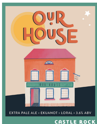
OUR HOUSE 3.4 %

Brewed to the traditional East Midlands style, Preservation is a russet-coloured, easy drinking full flavoured best bitter. SILVER SIBA Midlands 2024 Cask British Bitter Category.