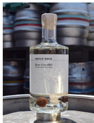
BEER GIN #007

A zesty mix of orange peel, grapefruit and lime for a fresh and fragrant gin. A medley of citrus fruits and a touch of fiery sichuan pepper make this gin a wonderful match for a classic tonic.