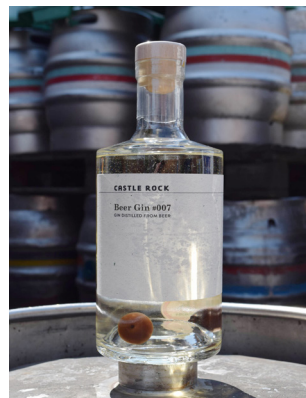
BEER GIN #007 70CL • 42% ABV

A zesty mix of orange peel, grapefruit and lime for a fresh and fragrant gin. A medley of citrus fruits and a touch of fiery sichuan pepper make this gin a wonderful match for a classic tonic.