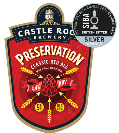
PRESERVATION 4.4 % ABV

Full-bodied mild with a hoppy aroma and well-balanced bittersweet taste. GOLD CAMRA Champion Beer East Mids Region.