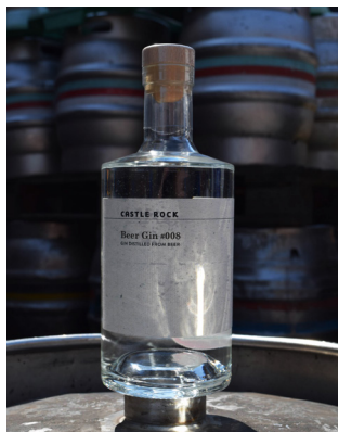
BEER GIN #008 70CL • 40% ABV

We started working with a distillery to turn our surplus beer into gin! Our available gins this week include some classic flavour profiles and others offering something a little different. Enjoy!