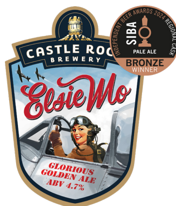
ELSIE MO 4.7 % ABV

A lower-alcohol and sessionable quality alternative. Our House is an easy-drinking extra pale ale with a satisfying crisp finish.